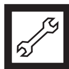
1 Year Warranty